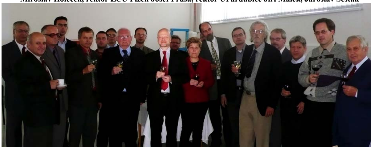
Spoluautoři knihy „Some thermodynamic, structural and behavioral aspects of materials accentuating noncrystalline